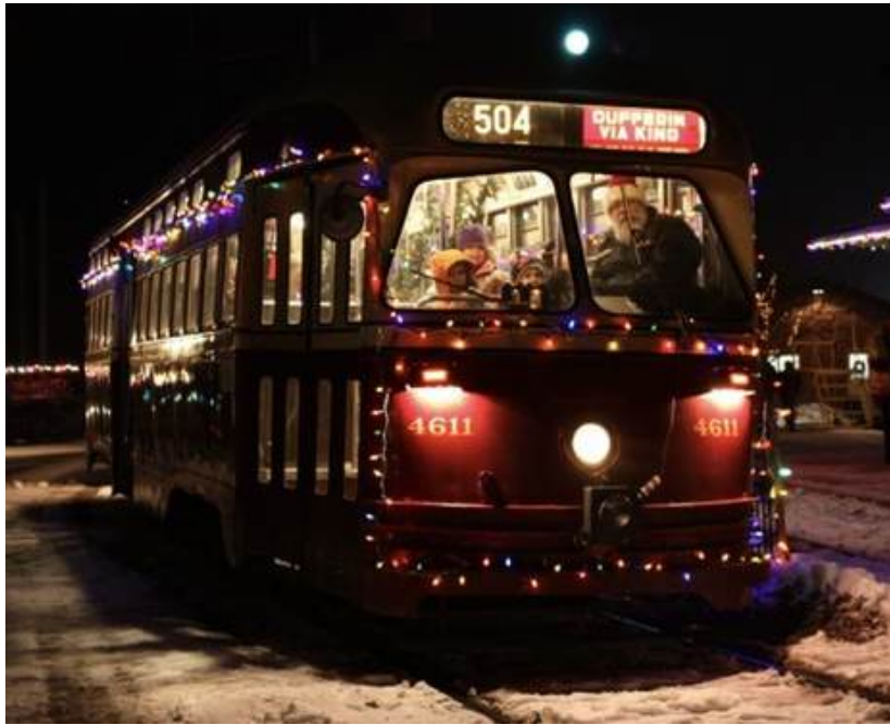
HALTON COUNTY RADIAL RAILWAY MUSEUM 13629 GUELPH LINE, MILTON, ON

Ride the rails on vintage streetcars through the woods with snow on the trees and Christmas carols in the air. Santa comes to visit, roams around, and sometimes even drives the streetcar to the North Pole.