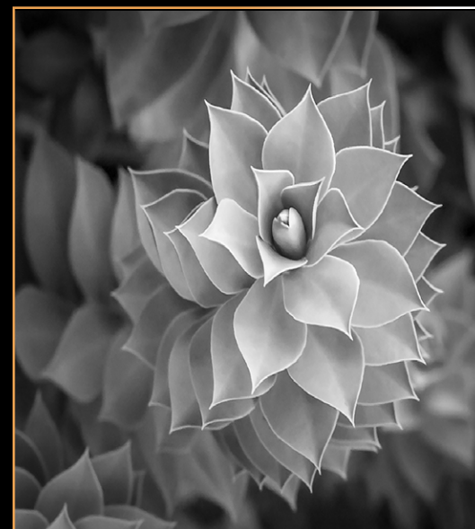
HIDDEN BEAUTY, OAKS GARDEN