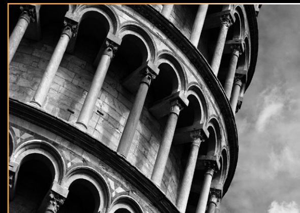
LEANING TOWER OF PISA, ITALY