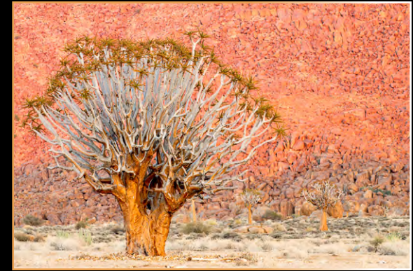
SOUTH AFRICAN QUIVER TREE