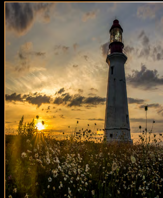
LOW POINT, NOVA SCOTIA