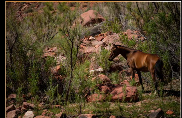
WILD HORSE OF GLEN CANYON, ARIZONA, USA