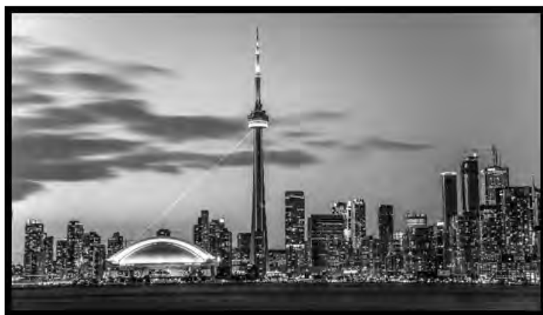
Nuit Blanche (Art Festival), Toronto, Canada