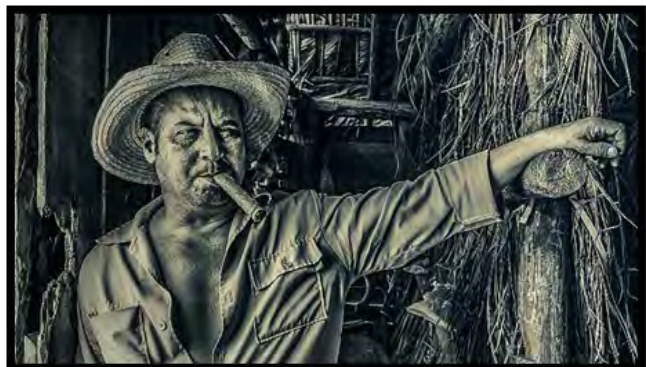
The Cigar Curer, Vinales, Cuba