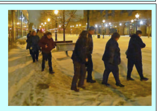
A cold walk in the snow!

Those members who attended the NFRCC 5oth Convention reported that the speakers were excellent, and (despite the inclement weather and a miserable walk between the Convention Centre and the hotel), the weekend was a worthwhile experience.