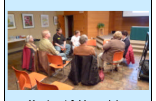
Members' Critique night