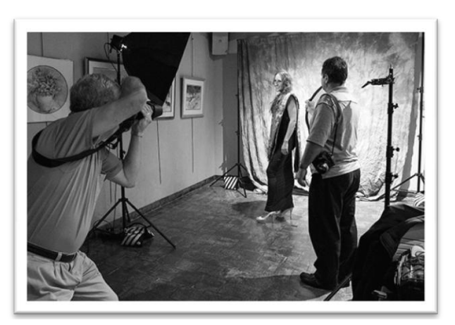
Image below is from the model shoot at the club on October 4, 2015. More images on the last page!

<u>DIGITAL IMAGE/PRINT OF THE YEAR:</u> For the digital image/print of the year competition, please go through your previous digital and print submissions from this years competition entries and choose 4 from each of digital entries, colour prints and monochrome prints. All entries are to be as they were when entered into competition originally, no